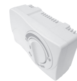
GF-MHX3 Manual Humidistat Included in GF-1042DMM