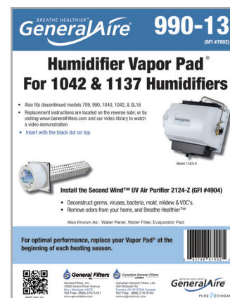
GF-990-13 Vapor Pad®