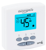
GFX4 Automatic Humidistat Controls the Furnace Blower Motor